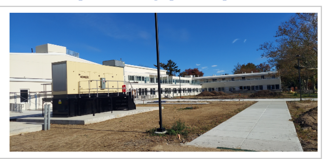
Rear View of the facility & generator