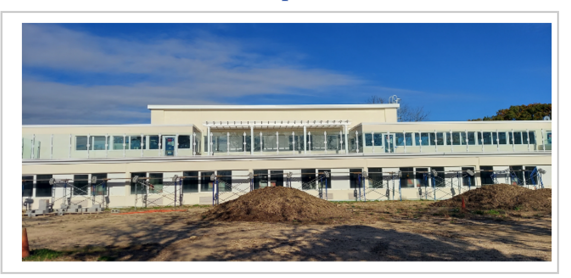
View of the 2<sup>nd</sup> floor Memory Care Wing & Outdoor Terrace