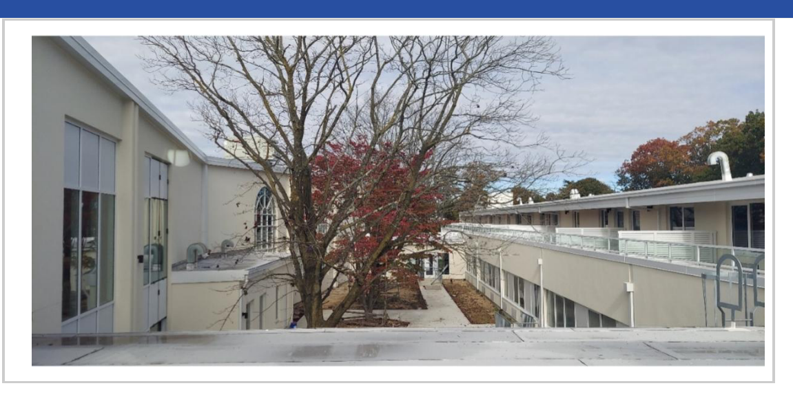
View of Independent Living Apartment private terraces