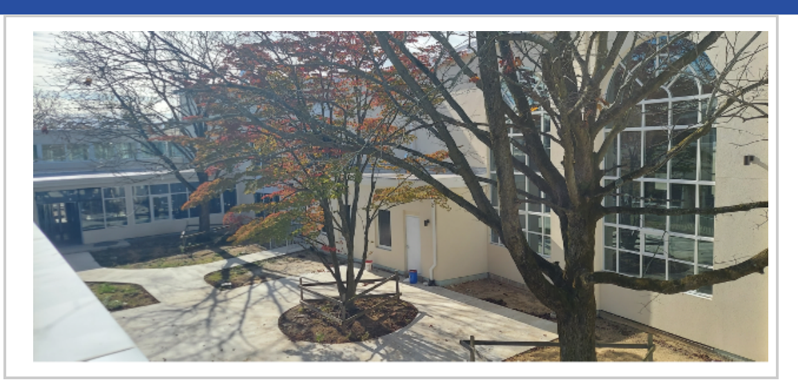
One of the two enclosed courtyards on either side of the chapel