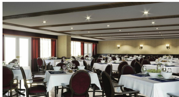
St. Michael's Dining Room