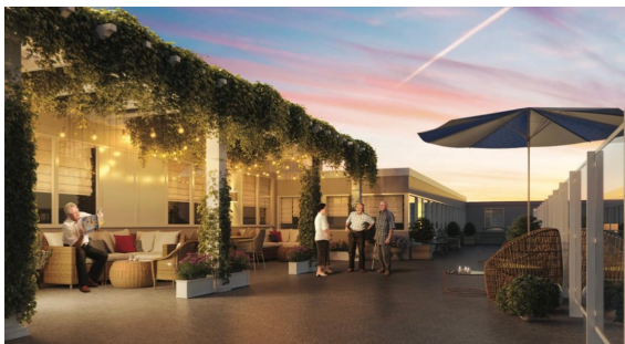
St. Michael's Memory Care Roof Garden