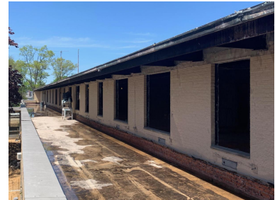
Second floor of East Wing's Independent Living where private balconies will be constructed

Please help us continue the work by making a donation NOW .