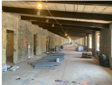
View of East Wing's future Independent Living Bedrooms